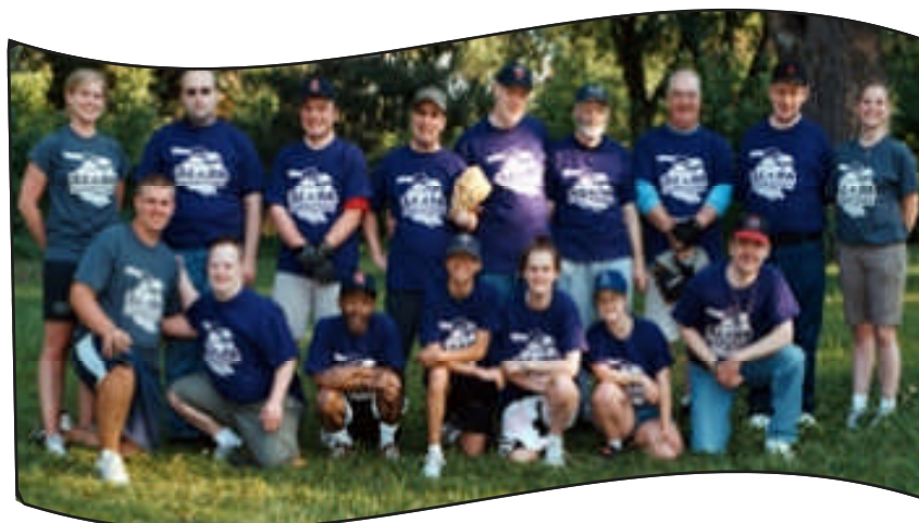
Adult Softball on page 5