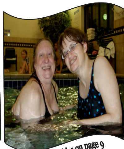
Water Aerobics on page 9